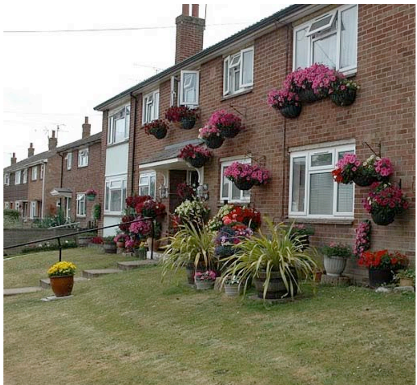
A floral display in Jenner Way

We are hopeful that by the time of our next Report substantial further progress will have been achieved.