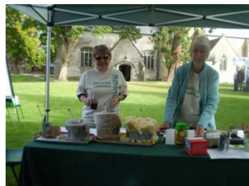
Two members of the Home Insulation team from the Greening Campaign, preparing an experiment that highlighted the benefit of different types of insulation materials. Taken at the St Lawrence Green Festival, September 26th 2009.