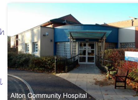
Alton Community Hospital

"... has moved with the times but retains that friendly small market town feel"